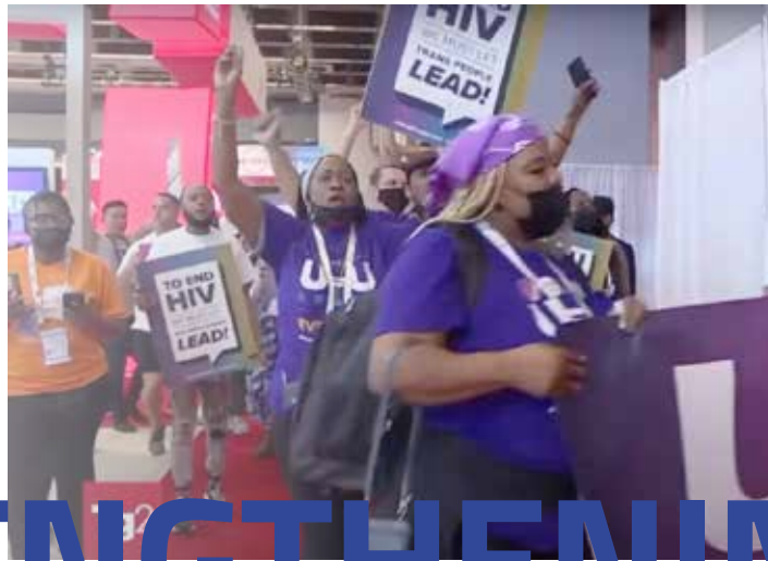
Italian television station RAI filmed the various events and protests that took place during the AIDS Conference in Montreal.