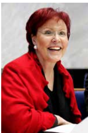
Heidemarie Wieczorek-Zeul, Vice-President in charge of Germany

“The global health politics of 2022 show how Russia’s attack on Ukraine is not only devastating the livelihoods of Ukrainians and the European stability architecture, but also generating terrible ripple effects on the progress of the SDG agenda. We must not allow the SDGs to become another victim of the war against Ukraine, and we have to fulfil our obligations, mobilising the necessary financing and preventing the constitution of new blocs”.