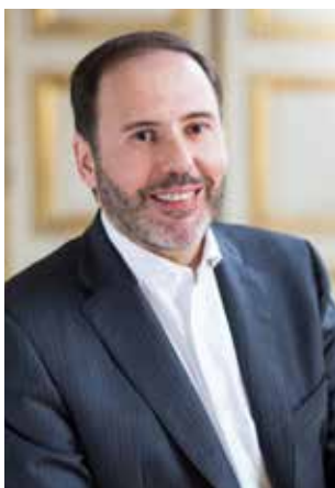
President of Friends of the Global Fund Europe