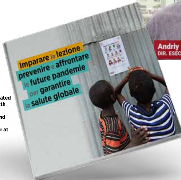
Friends Europe participated in the creation of a health guidance document on pandemic prevention and preparedness that was presented in September at the Italian Senate.