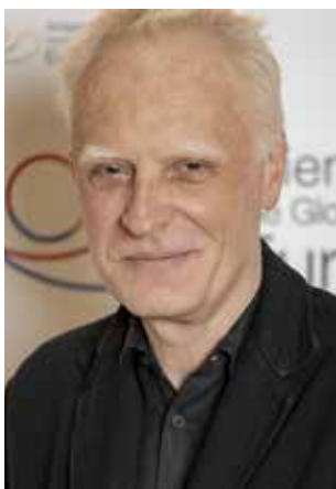
Editor-in-Chief of The Lancet and member of the Friends of the Global Fund Europe Advisory Committee