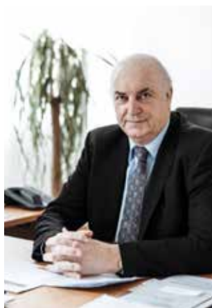
Charles Goerens, Vice-President for European institutions, Belgium and Luxembourg

Publications launched as part of the #WhateverItTakes campaign to call for a 30% increase of the EU contribution to the Global Fund.